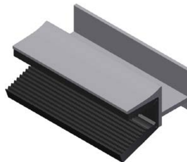
Figure 2: Jurchen MK-A II HR End Clip