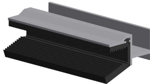
Figure 2: Jurchen MK-A HR End Clip