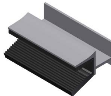
Figure 2: Jurchen MK-A II HR End Clip