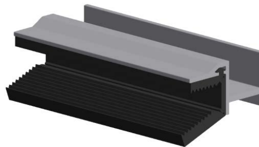
Figure 2: Jurchen MK-A HR End Clip